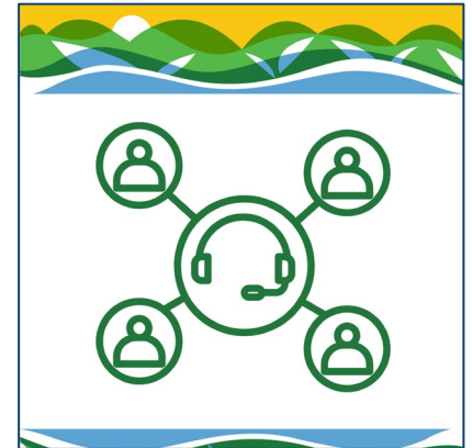
Call Volume & Abandon Rate