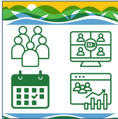
Appointments, Visitors & Webinars