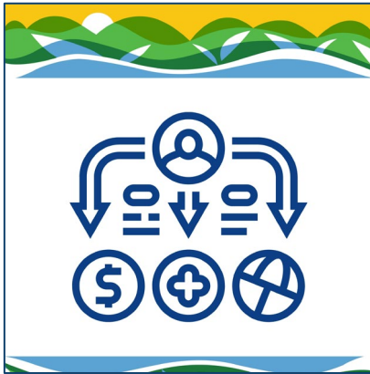
About Benefits Processing