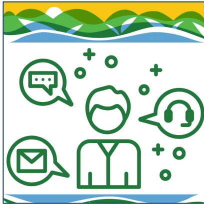
About Member Services