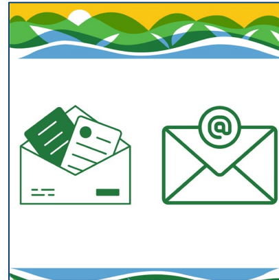
Correspondence & Email