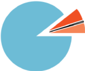
Shareholder Proposals – Votes versus Management

With Mgmt - 5440 Against Mgmt - 340 Take No Action - 275 N/A - 33