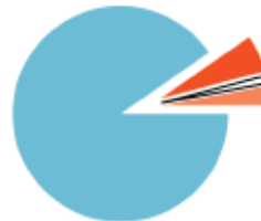
Shareholder Proposals – Votes versus Management

With Mgmt - 5530 Against Mgmt - 341 Take No Action - 180 N/A - 69