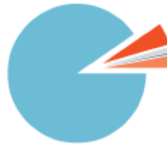
Shareholder Proposals – Votes Cast

For - 5536 Against - 312 Abstain - 76 1 Year - 16 Take No Action - 180