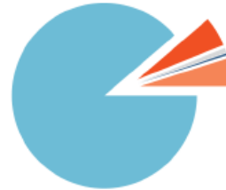
Shareholder Proposals – Votes Cast

For - 5732 1 Year - 23 Against - 334 Take No Action - 317 Abstain - 53