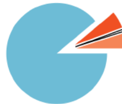
Shareholder Proposals – Votes versus Management

With Mgmt - 5745 N/A - 44 Against Mgmt - 353 Take No Action - 317